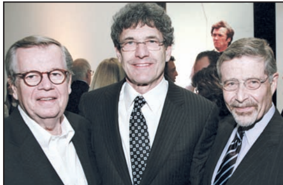
Bob Daly with Warner Bros. President and COO Alan Horn, and Barry Meyer, Chair and CEO